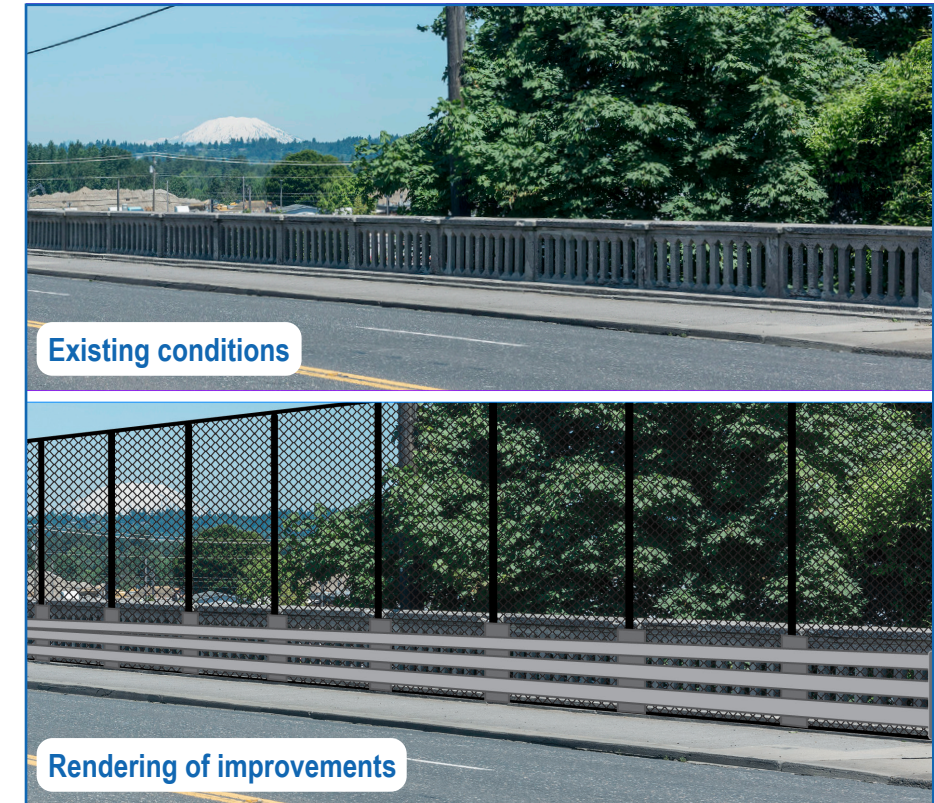
Top: The existing historic rail. Bottom: A rendering of the bridge with the additional rail and protective screening installed.

Sign up for project emails online or by contacting ODOT.